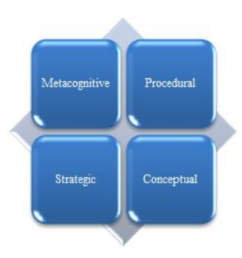
Figure 3 Types of Scaffolding

Metacognition is a type of Self-Regulated Learning, which deals with the ability of reasoning, managing and redirecting personal knowledge for the learning. Metacognition can be decomposed into two components such as knowledge and regulation. Metacognitive knowledge refers to the comprehension of the working of the mind. In other words, it is awareness and knowledge about cognition metacognitive can be categorized into three components: knowledge of person variables, knowledge of task variables and knowledge of strategy variables.